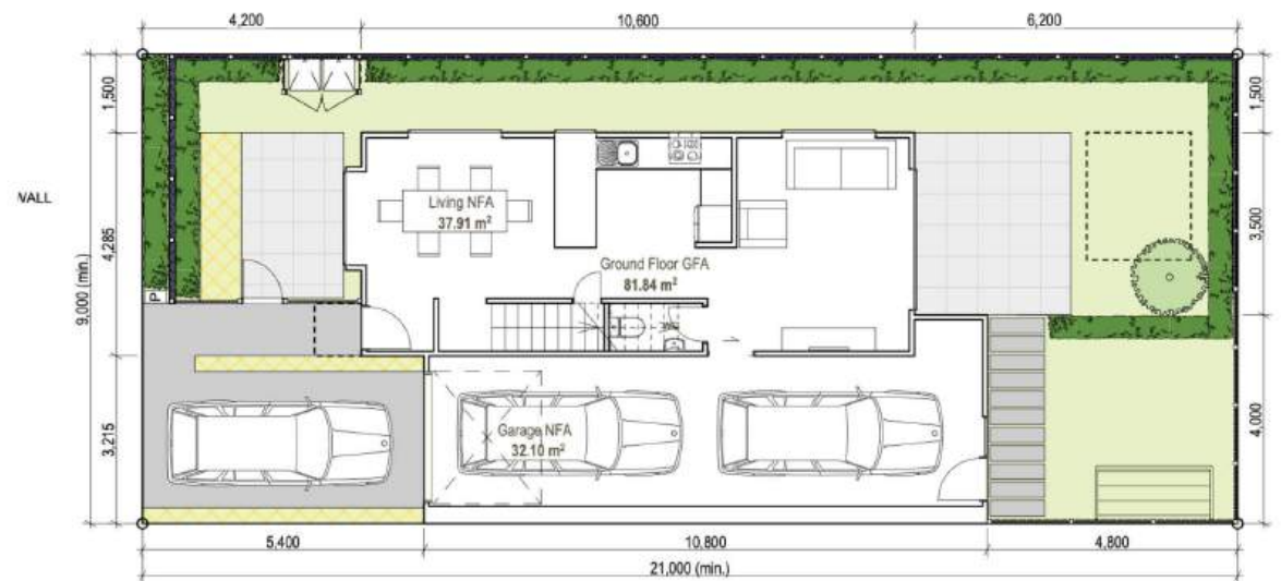
Ground Floor 1:100