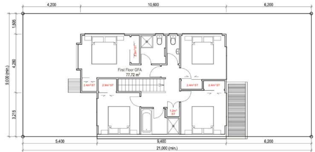
Level 1 1:100